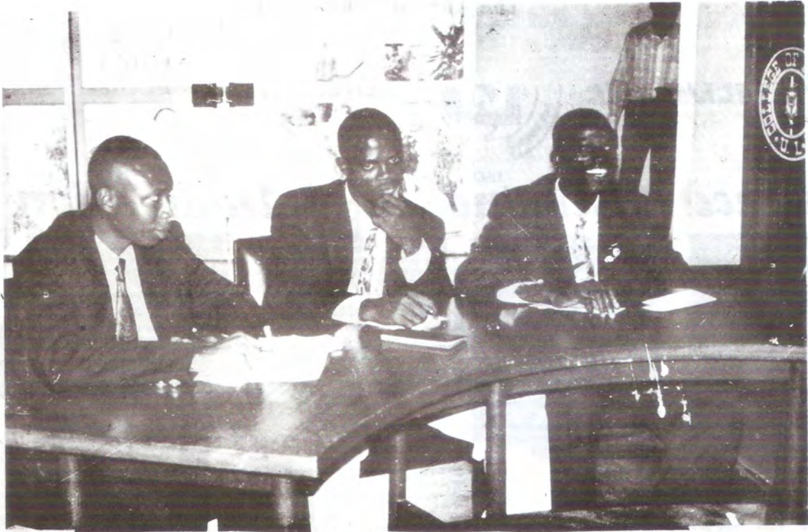
At the Prof O.O. Akinkugbe Quiz Competition Finals