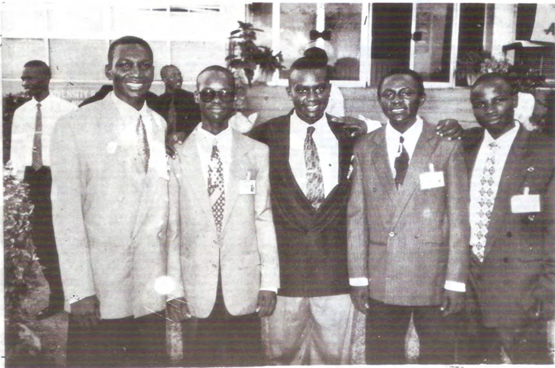
Some Board members after a programme... It is a family.