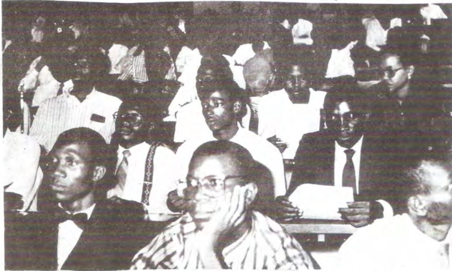
Listening with rapt attention at a DOKITA symposium