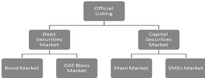
Figure 1. Organizational chart