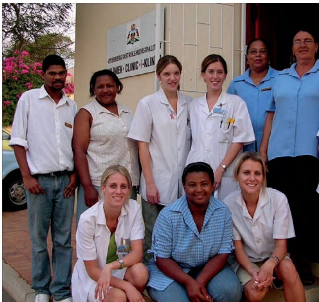
Fig. 4. Outside Napier Clinic - staff and 5th-year MB ChB students.

then, an effective and collegial relationship has developed with local pharmacies, resulting in an increased range and supply of medication to cope with down-referrals.