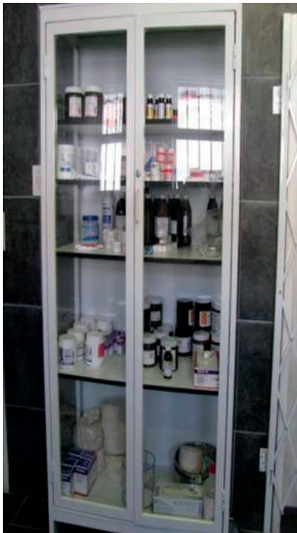
Fig. 5. The locked cabinet for immediate patient care in the day care treatment area.