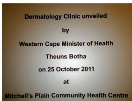
Fig. 1. The wall plaque outside the dermatology clinic and day care centre, commemorating the official opening of the centre by Theuns Botha, Minister of Health, Western Cape Government, on 25 October 2011.

The Groote Schuur Hospital dermatology day care centre is run by a clinical nurse practitioner and an enrolled nurse and accommodates up to 600 patient treatment visits monthly.