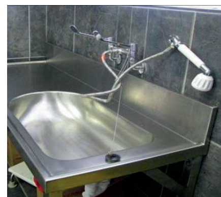
Fig. 4. Stainless steel basin and shower with surrounding dark porcelain tiles for hair washing in the day care treatment area. These prevent soiling and degradation of the facilities by topical therapies that stain fomites.

nurse training, which includes modules on wound care. Wound care facilities are provided at the clinic. A phototherapy unit has recently been donated to the centre, which will further reduce the need for local patients to travel to tertiary units.