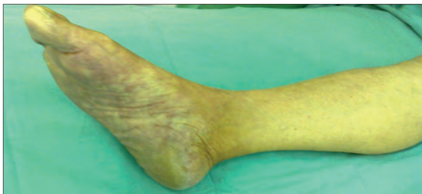
Fig. 2. Pale foot with bluish dermal staining. Note the collapsed veins.

Patients are exposed to the risk of local and remote haemorrhagic complications and proper case selection is critical (Table 4). The success of CDT is determined by the ability of the angiographic catheter to cross a thrombosed