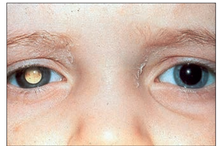
Fig. 7. Abnormal red reflex in the right eye.