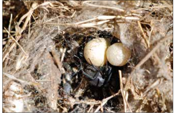
Fig. 3. The egg sacs of the black widow spider ( L. indistinctus ) are white to greyish yellow in colour with a smooth silky surface.

pattern, ranging in colour from cream to brown and orange. They are further characterised by a consistent orange to red hourglass marking on the ventral surface of the abdomen. The joints of the