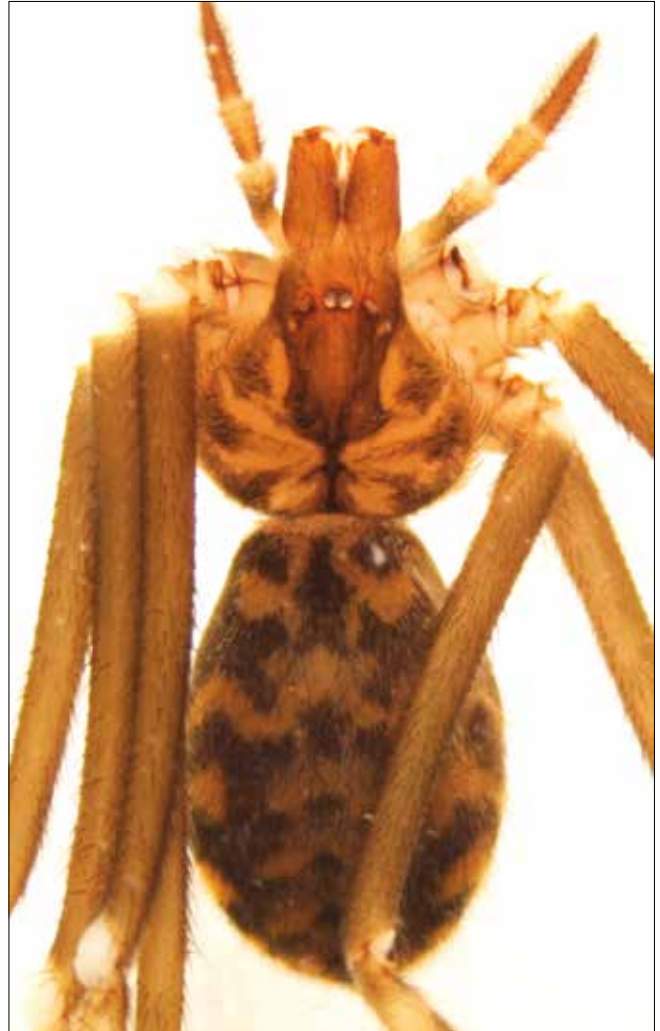
Fig. 15. Violin spider ( Loxosceles simillima ) with characteristic mark of a violin on the dorsal surface of the carapace (larger part of the violin towards the front end).

Figs 15 and 16 show the morphological characteristics of the violin spider.