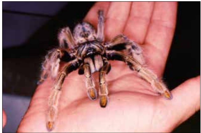
Fig. 19. Baboon spider.