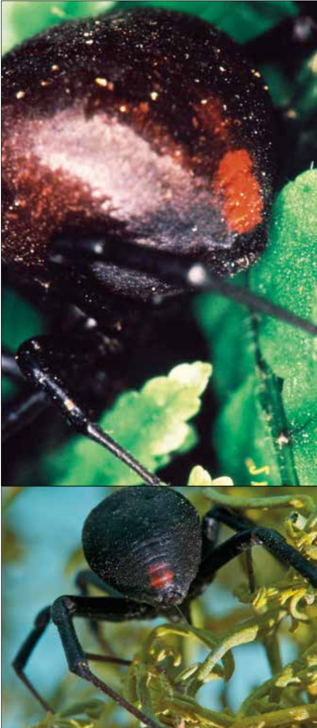
Figs 1 and 2. Black widow spider ( L. indistinctus ) with a typical red spot on the dorsal surface just above the spinnerets (silk-producing organ).

pattern, ranging in colour from cream to brown and orange. They are further characterised by a consistent orange to red hourglass marking on the ventral surface of the abdomen. The joints of the