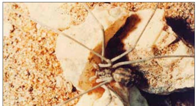
Fig. 16. Violin spider with long, slender legs.

Most of the venom components of sac and violin spiders are enzymes with cytotoxic effects. An important component includes hyaluronidase, a spreading factor that increases the size of the tissue lesion.