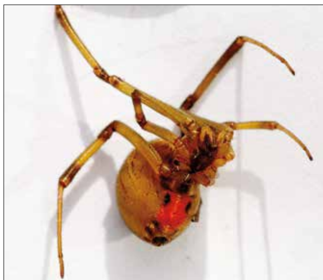
Fig. 6. Brown widow spider depicting consistent orange to red hourglass marking ventrally.

Black widow spider bites usually cause burning pain at the bite site, although some victims are not aware of being bitten. The majority of bites occur on an extremity. The pain typically spreads to the inguinal or axillary lymph nodes within 5 - 15 minutes. The bite site can usually be located, but the local inflammatory reaction is