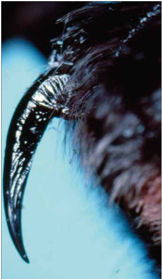
Fig. 20. Fang of baboon spider, often larger than that of the Cape cobra.