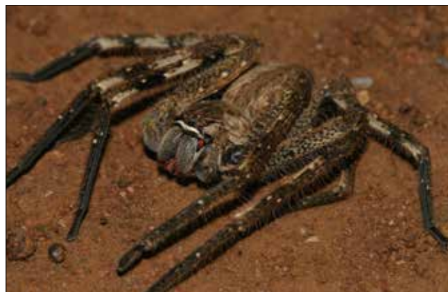
Fig. 21. Wandering or rain spider (Genus: Palystes ).

Fig. 19 shows the baboon spider. Fig. 20 shows the fang of the baboon spider.