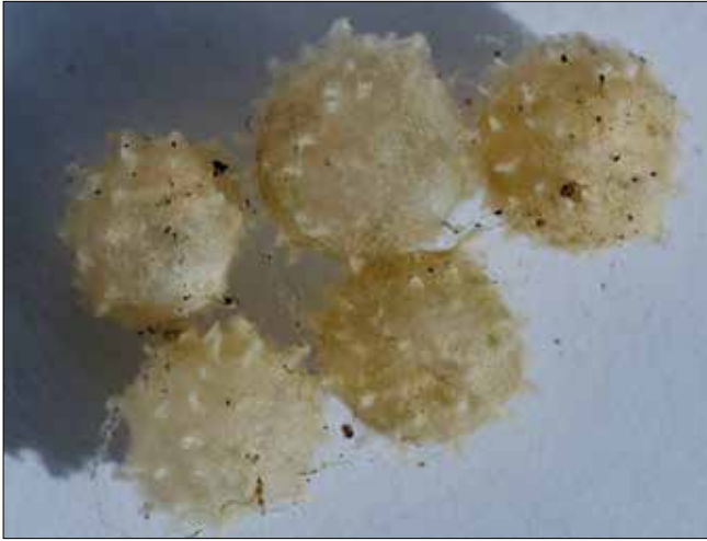
Fig. 8. Brown widow spider egg sacs with numerous spicule-like projections.

and oedematous face, especially peri-orbitally, with accompanying conjunctival injection. The blood pressure is usually markedly raised and the pulse rate is rapid, although a patient occasionally may present with marked bradycardia. A slight fever is sometimes present. Laboratory and radiographic investigation are of little value as an aid in the diagnosis. In patients not treated with antivenom the condition may become protracted, without improvement for days to a week or more. This can lead to a general state of exhaustion and dehydration. Patients particularly at risk are small children, the elderly and those with cardiovascular and respiratory disease. Although no deaths as a result of widow spider bites have been documented in recent times, accounts by various authors before the mid-1960s report a mortality rate of 1 - 6%.