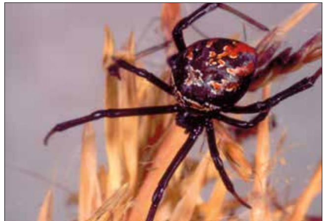
Fig. 4. Sub-adult black widow spider ( L. indistinctus ) with red markings on the dorsal surface of the abdomen.

legs are darker and impart a banded light to dark brown appearance. The egg sacs of L. geometricus can easily be distinguished from those of the black widow spiders by numerous spicule-like projections distributed over the surface. The webs of this cosmopolitan species are commonly found around homes throughout southern Africa. They have a predilection for window sills, drain pipes, garden furniture, garden sheds, post boxes, barns, stables and outdoor toilets. L. rhodensis cannot be distinguished macroscopically from L. geometricus ; however, the egg sacs differ from those of L. geometricus in that they are about two-and-a-half times larger and have a woolly appearance, without the spicule-like projections.