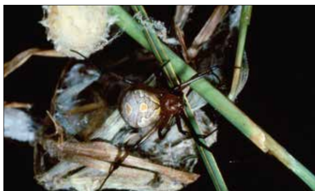
Fig. 7. Brown widow spider: dorsal surface of the abdomen displays an intricate pattern of well-demarcated geometrical markings.

mild and often unimpressive. No bite mark is detectable in 30% of cases, even in the presence of severe systemic symptoms and signs of envenomation. Within an hour the patient develops generalised muscular pain and cramps, especially in the abdomen, chest, back and thighs. The pain in the bigger muscle groups (girdle muscles) rapidly increases in severity and is sometimes described as excruciating. There is a feeling of weakness in the legs and difficulty in walking. A feeling of tightness in the chest, which is interpreted by some victims as difficulty in breathing, is often described. An erection is occasionally experienced, especially in children. The patient appears anxious and sweats profusely, and clothes and bedding are often soaked with sweat. The regional lymph nodes are tender and occasionally palpable. A board-like rigidity of the abdomen is characteristic and the general position of flexion the patient may assume is a sign of increased muscle tone. Coarse involuntary movements and brisk tendon reflexes are often observed. An interesting (although not a regular) feature is a flushed