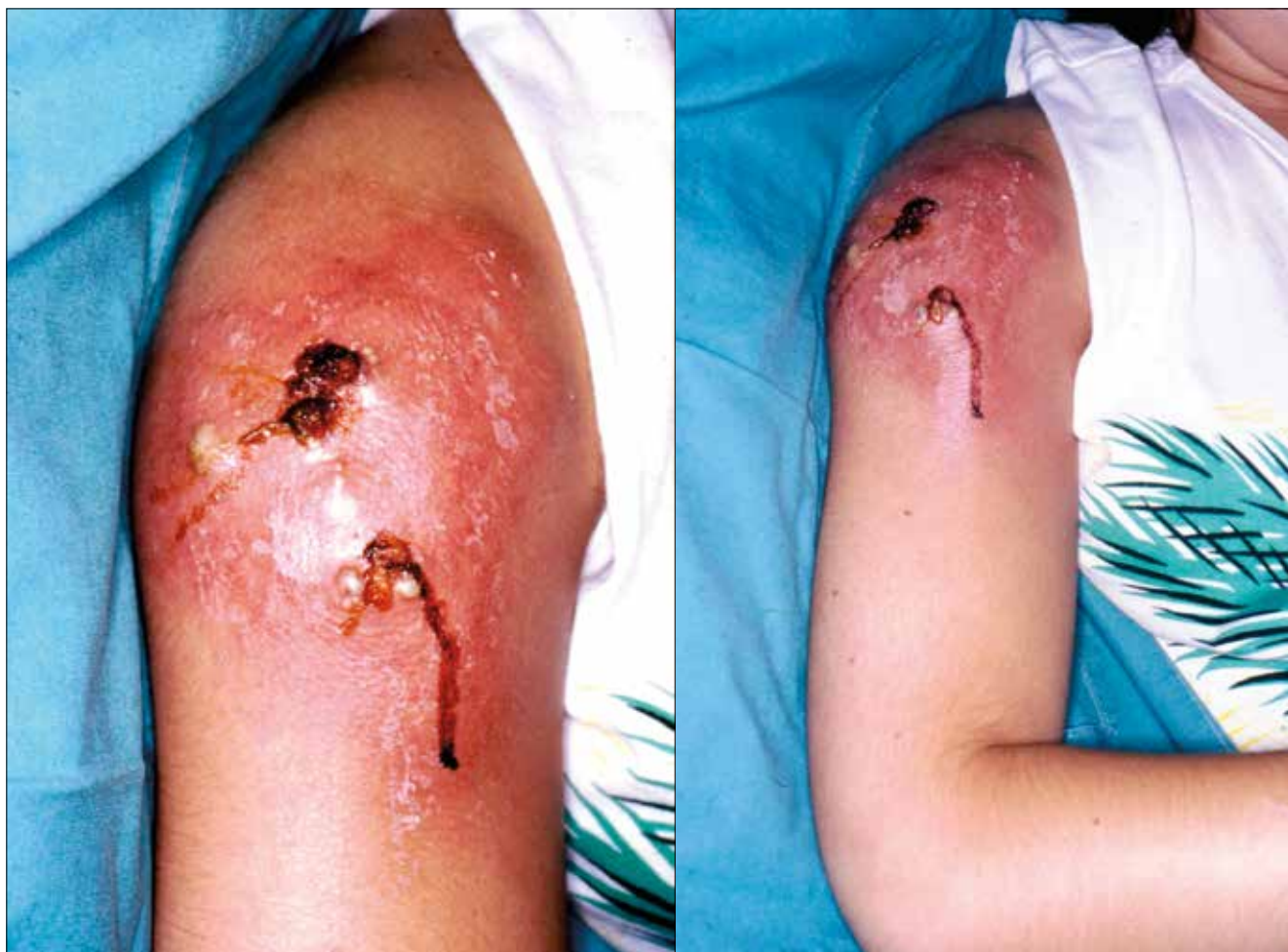
Figs 17 and 18. Sac spider bite on right shoulder with subcutaneous suppuration. Debridement and skin graft eventually needed.