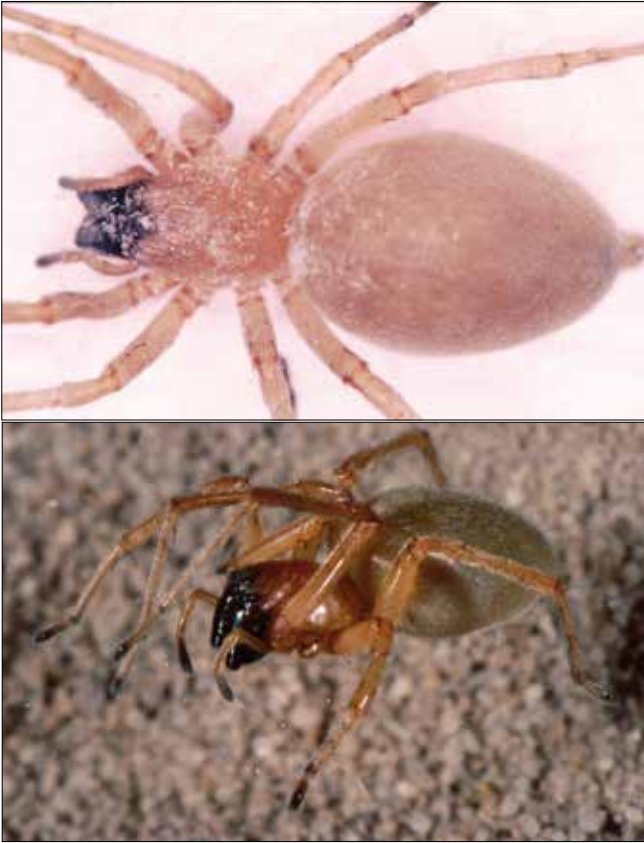
Figs 13 and 14. Sac spider showing general colour features and black mouth parts.

house and are often found in the folds of curtains, clothing and cupboards where they make sac-like retreats of thin silk in which they hide during the day. They are aggressive and will bite at the slightest provocation. Most victims are bitten while asleep.