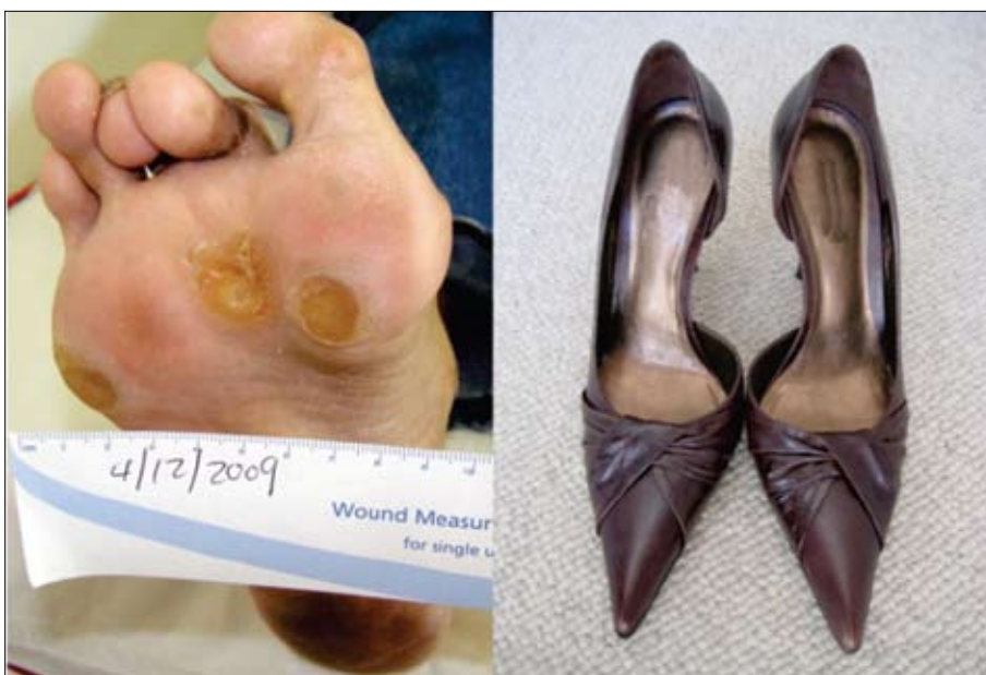
Fig. 2. Naughty and not-no-nice: inappropriate footwear for a neuropathic diabetic foot.

The majority of patients with clinically detectable PVD are asymptomatic. Less than 25% with significant disease report intermittent claudication. End-stage symptoms are ischaemic rest pain (especially at night) and ulceration/gangrene. Many of these patients, however, may not experience any pain despite extensive tissue loss because of sensory loss due to their peripheral neuropathy.