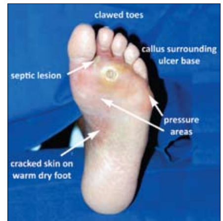
Fig. 3. Clinical features of a neuropathic foot.