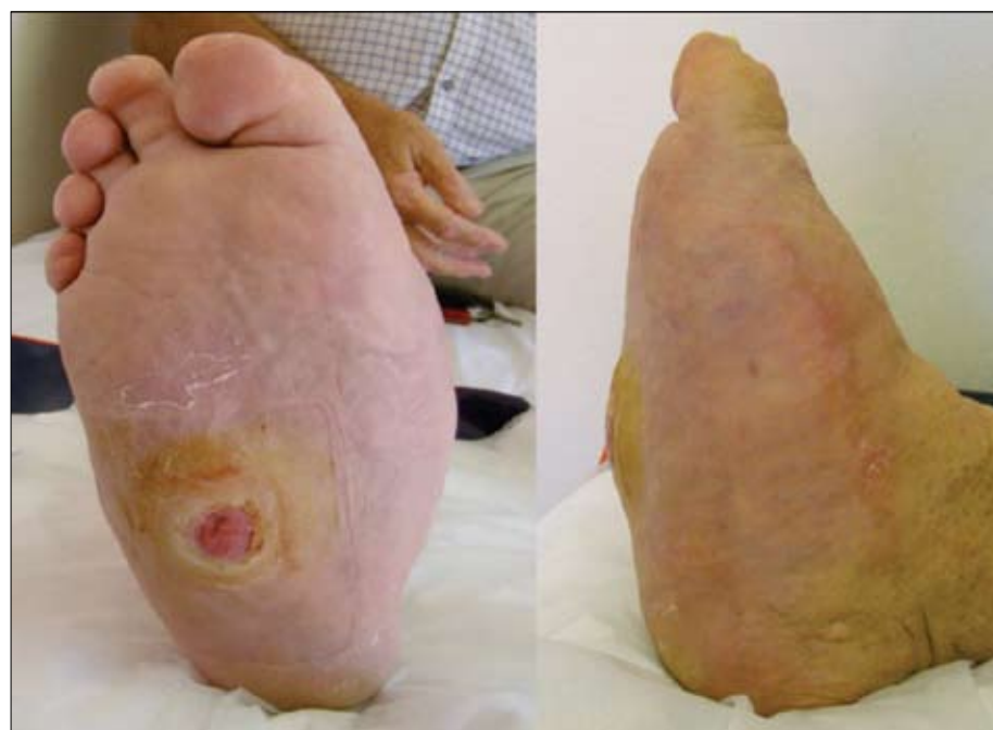
Fig. 5. Charcot's foot with rocker-bottom foot deformity and plantar ulcer.

Neuro-ischaemic feet are cool and pulses are absent. Ischaemic rest pain, ulceration at the edges of the foot from localised pressure damage, and gangrene may occur in addition to neuropathic complications. 2