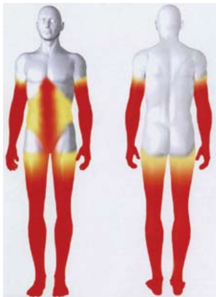
Fig. 2. The stocking and glove distribution of diabetic distal symmetrical polyneuropathy. A distal dying back of the nerve fibres occurs, resulting in the involvement of the hands and feet in this pattern.

Modifiable risk factors in the disease process include hyperglycaemia, hypertension, hypercholesterolaemia, heavy alcohol abuse and smoking. In fact, hyperglycaemia has been shown to be the strongest risk factor for the development of DPN. In both the DCCT (Diabetes Control and Complications Trial) and the UKPDS (United Kingdom Prospective Diabetes Study), it was conclusively demonstrated that better glucose control prevents or slows the progression of diabetic neuropathy.