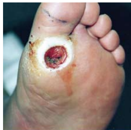
Fig. 4. Neuropathic ulcer.

In recognition of these various factors, there is international agreement and evidence that the most successful way to avoid foot complications in diabetes is by screening and regular foot examination. 1-4,7 There is less consensus on who should perform the examination. It can be performed by anyone who has been correctly trained and who has the basic equipment. The point to remember is that the purpose of the examination is to establish a level of risk for complications – the foot risk status – and act accordingly. 1-3,9 This examination, as part of another well-proven strategy – multidisciplinary team management of diabetes – has been shown