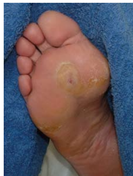
Fig. 3. Callus with early ulcer.