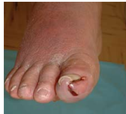
Fig. 2. Injury: cutting nail.

Another factor that is being increasingly recognised is the impact of psychological and behavioural issues on the diabetic foot. This could explain why some patients get repeat ulceration or fail to prevent ulceration in spite of being warned of their risk for ulceration. These changes to a patient's cognitive abilities appear to influence their ability to comprehend and therefore can reduce the effectiveness of foot health education. 3,6