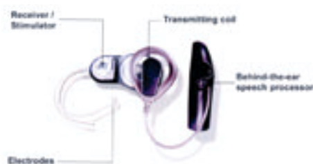
Fig. 2. Diagrammatic representation of the Nucleus 3 cochlear implant system.

and the intensity level required to generate the appropriate sound sensations. The electrodes stimulate the nerve fibres via a controlled electrical current which is recognised by the brain as sound. Electrical stimulation of the auditory system is effective, because almost all sensorineural hearing loss is caused by hair cell dysfunction, while the auditory nerve itself remains responsive to stimulation and can conduct impulses carrying auditory information to the brain. 2