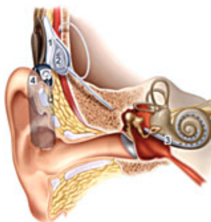
Fig. 1. Diagrammatic representation of internal and external components. 1: Nucleus 24 Contour implant; 2: receiver/stimulator; 3: Contour electrode array; 4: ESPrIt 3 G speech processor.

and the intensity level required to generate the appropriate sound sensations. The electrodes stimulate the nerve fibres via a controlled electrical current which is recognised by the brain as sound. Electrical stimulation of the auditory system is effective, because almost all sensorineural hearing loss is caused by hair cell dysfunction, while the auditory nerve itself remains responsive to stimulation and can conduct impulses carrying auditory information to the brain. 2