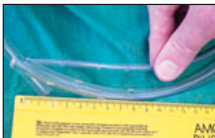
Fig. 1. The larger tube is the minimum diameter required for effective gastric lavage in adults (32F). The stomach tube held (minimum size required for children) is the size (16F) routinely used for adults in most South African hospitals. It is clear that much larger tubes should be used for the effective removal of solid materials, e.g. tablets.

children, should be used if solid material, such as tablets, capsules, etc. has been ingested (Fig. 1). In patients at risk of aspiration (e.g. patients with CNS depression or predisposed to seizures) airway protection is essential before gastric emptying is attempted. 6