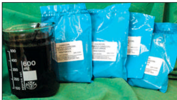
Activated charcoal is safe and easy to use.

Although alkaline diuresis increases the elimination of salicylates, phenoxacetate herbicides, phenobarbitone and barbitone, it is not always possible to achieve the required urinary pH of 8 and higher with administration of the recommended 4.2% sodium bicarbonate solution. Furthermore, the procedure should not be undertaken without access to intensive care facilities since frequent biochemical monitoring and appropriate responses to results are required. Consequently, this method of enhanced elimination is not generally resorted to. Acetazolamide has been reported to be an effective urinary alkalinising agent at a dose of 250 - 500 mg intravenously. However, acetazolamide should not be used in the management of salicylate poisoning since it may exacerbate toxic effects on the central nervous system. Multiple-dose activated charcoal is a safer and easier alternative to alkaline diuresis.