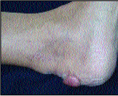
Fig. 3. Achilles xanthomata. This patient has the unusual combination of a tuberous xanthoma at the ankle and a xanthoma in the Achilles tendon.

mixed hyperlipidaemia. Fig. 3 shows a tuberous xanthoma at the ankle. Tuberous xanthomata are most commonly found at the elbows.