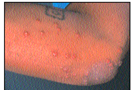
Fig. 2. Eruptive xanthomata. The patient initially presented to a dermatologist with a rash. He had newly diagnosed diabetes and his triglyceride level was 85 mmol/l. There is probably some (minor) genetic predisposition aggravated by the diabetes.