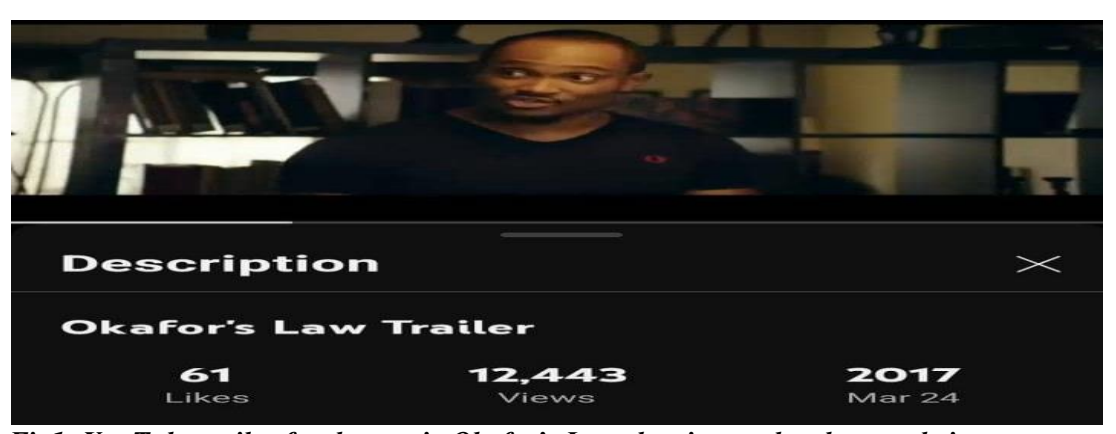
Fig1: YouTube trailer for the movie Okafor's Law showing twelve thousand viewers

The quest for seriously tackling all shades of perceived piracy is because "the average income per film appears to be a mere break-even for most low budget film producers. This poor return has been attributed to film piracy. The industry produces well over 2,500 movies annually, but piracy, it is believed, takes a larger chunk of the expected profits due to filmmakers" (Iwuh et al., 29). The criteria for securing the copyright of a creative work is that it must have been expressed in a tangible medium like published text, recorded films or painting, etc. This explains why it would be difficult to establish the ownership of a creative work which still exists as an idea. Elaborating on this Quadri argues that "any registration with the NFVCB would only be in relation to censorship for completed films only as NFVCB only deals with completed works"(5).