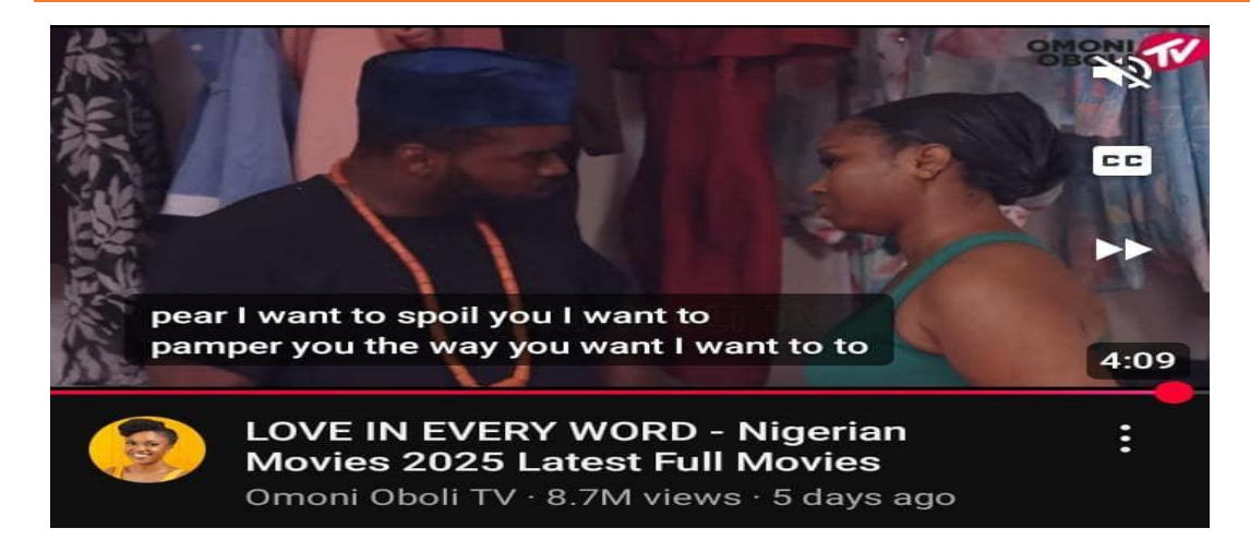
Fig 6: Omoni oboli Tv shows over eight million viewers after fifth day of movie launch

This development shows that while fast-tracking rate of sales, digital marketing helps in the process of creating high level of guaranteed copyright protection in Nigerian film space by exposure of the slightest form of copyright infringement.