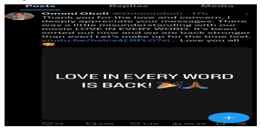
Fig.5: Omoni Oboli celebrating the restoration of the movie streaming by YouTube

When YouTube suspended the movie, from all indications an amicable out-of-court reconciliation was reached that favoured all the parties involved. This is the only possible reasons for the speedy restoration of the movie after the first twenty-fours of suspension by YouTube. This could be substantiated by the fact that the Producer herself took to her official handle to notify her teeming supporters of the restoration of viewing access to the movie.