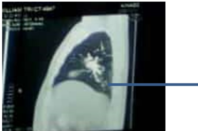
Figure 3: Sagittal view of Chest C T scan of the chest of the index case showing streaky hyperdense lesion in the posterior bronchopulmonary segment of the right lower lobe

He was commenced on anti-tuberculosis drugs for 6 months. He was on oral rifampicin 600mg daily, isoniazid 300mg daily, pyrazinamide 1,5g daily and ethambutol 800mg daily for the first two months, and rifampicin with isoniazid for the remaining 4 months. When he came for follow-up 4 weeks after commencement of anti-tuberculosis drugs, the cough had completely resolved and the patient had gained 4.5kg of body weight. He completed 6 months of anti-tuberculosis medications and was asked to do a new chest radiograph and come for follow-up in the chest clinic but he defaulted.