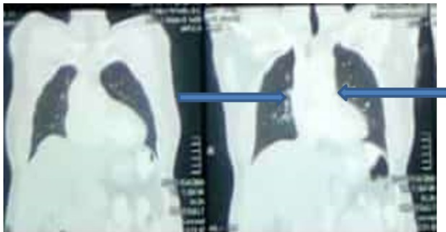
Figure 2: Chest C T scan of the chest of the index case coronal lung window view showing hilar lymphadenopathy.

node enlargement with hyperdense streaky lesions in the anterior and posterior basal segment of the right lower lobe and medial bronchopulmonary segments of the right middle lobe (Figure 2 & 3).