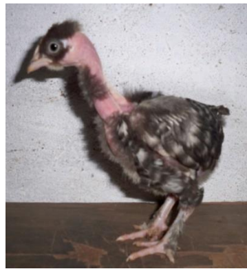
Heterozygous naked neck chick (Nana)