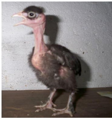
Homozygous naked neck chick (NaNa)