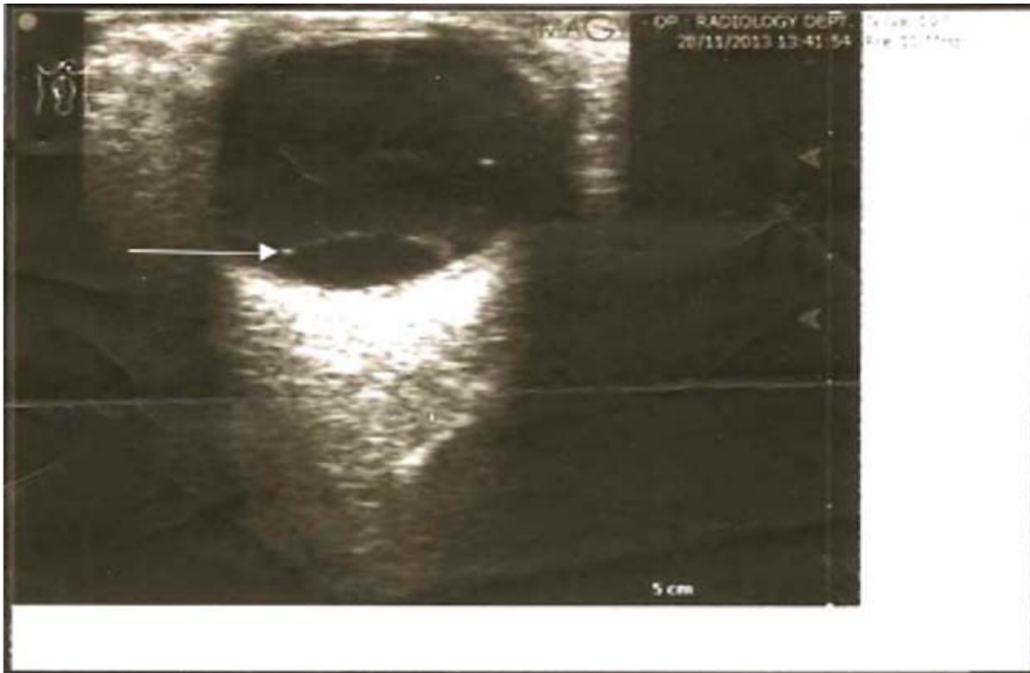
Figure 2: Transverse ultrasound image showing choroidal detachment (arrow)