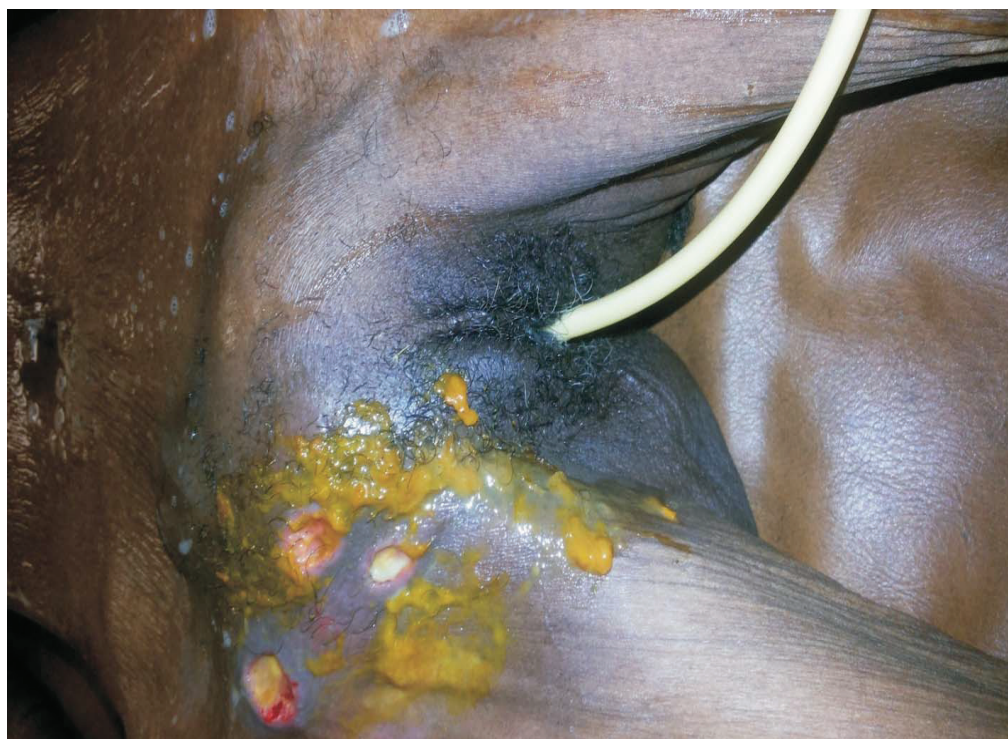
Fig 1: Multiple openings discharging feces over an indurated femoral swelling.

support were given. Intraoperative findings were incarcerated small bowel with multiple lateral fistulae involving hemi circumference with the largest having a diameter of 2.6cm (gangrenous portions have sloughed off- Fig.2). Patient had bowel resection, anastomosis with femoral herniorrhaphy under general anesthesia (Fig 2 and Fig 3). The post operative recovery was uneventful; she was discharged three weeks after surgery.