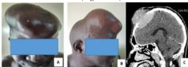
Figure 1: pictures (A) and (B) are the anterior and

His Full Blood Count, Electrolytes, Urea, creatinine, fasting blood sugar and clotting profile were normal. A presumptive clinical diagnosis of meningioma was made. Fine Needle Aspiration Cytology (FNAC) of the swelling revealed a cellular smear of mononuclear cells with round to oval eccentrically placed nuclei and moderate to abundant cytoplasm. Sheets of plasmacytoid cells mixed with lymphocytes and occasional histiocytes were noted. These findings are suggestive of plasmacytoma. Furthermore, the skeletal survey, bone marrow biopsy, serum lactate dehydrogenase, calcium, albumin, and renal function test were within normal limits. Bence Jones protein in the 24-hour urine sample was negative. Head computed Tomography (CT) revealed scalp swelling, and erosion of the skull with an intracranial but extradural extension, exhibiting multiple calcifications and uniform contrast enhancement (Figure 1 C).