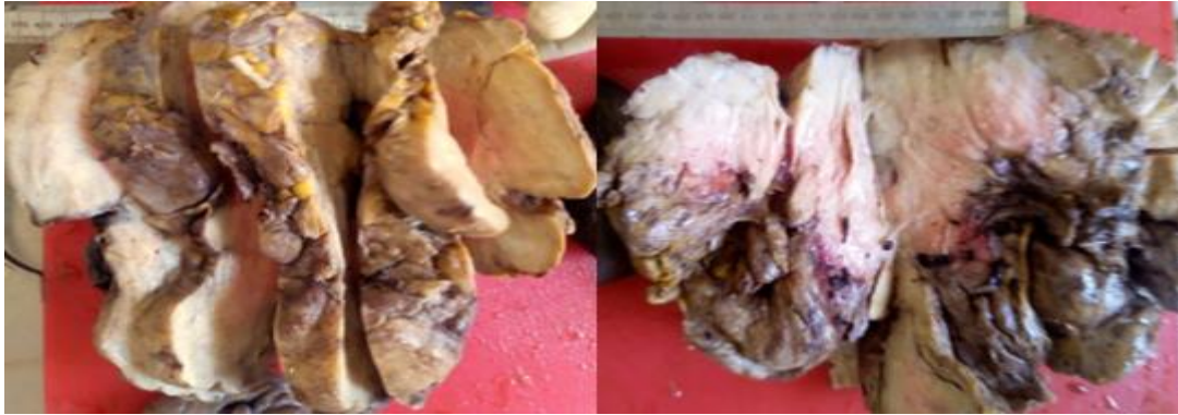
Figure 3: Gross specimen of breasts masses after fixation in 10% formalin, post mastectomy