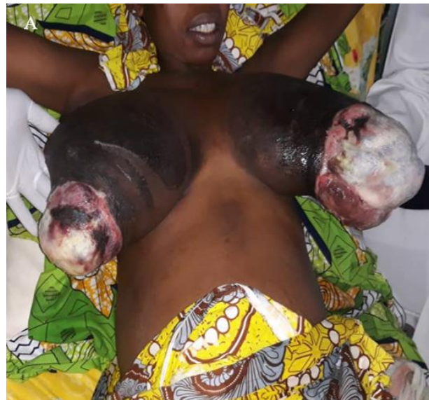
Figure 1: Preoperative picture of the bilateral gigantomastia with hyperpigmented skin and ulceration.

by double-layered epithelium and are arranged in lobular pattern in a hyperplastic fibromyxoid stroma with extensive oedema. There is marked adenosis and stromal hypertrophy. The features are consistent with gestational breast hypertrophy (figure 4). Verbal consent was sought from the patient before all the pictures were taken along with the history.