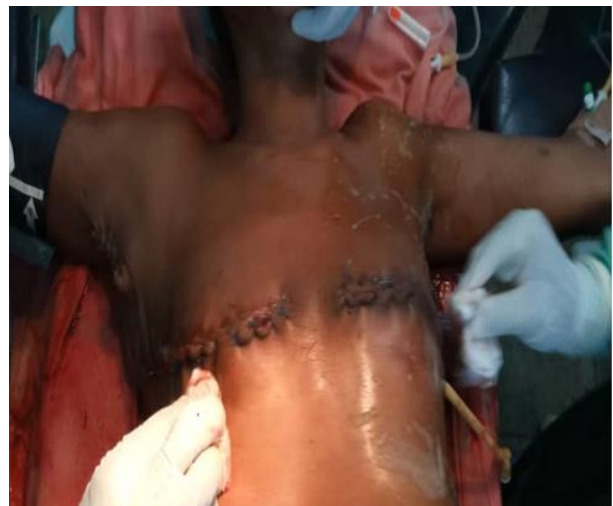
Figure 2: Bilateral simple mastectomy sutured wound