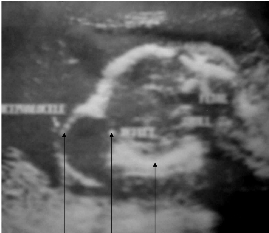
Figure 1: Sonogram of the longitudinal section of the fetal skull showing a defect in the occipital bone associated with an overlying anechoic cyst and well defined walls.

Placentation was separate having anterior and posterior components. There was no previa. Presentation of Twin 1 was cephalic and showed an occipital skull defect and an associated overlying sonolucent defect with well-defined margins continuous with the fetal scalp. There were no other associated anomalies such as ventriculomegaly or meningo-myelocele. (Figures 1 & 2)