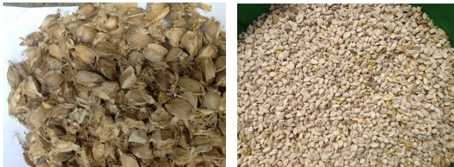
Figure 1. Picture of Moringa seed before and after removal of husk.