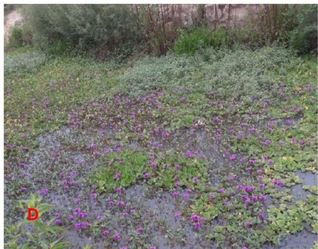
Plate 1: Cross section of the surface water in the sampling sites (A: Malalau, Site B: Rafin yan wanki, Site C: Kofar durbi, and D:Rafin yan tifa).