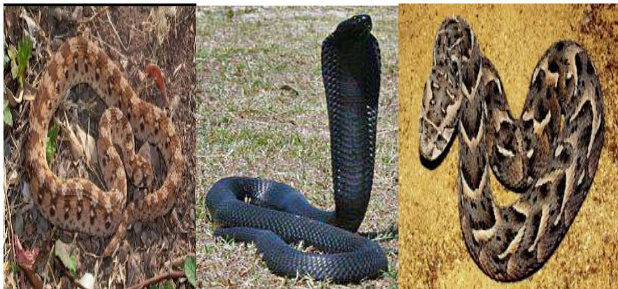
Figure 1: L-R: E. ocellatus , N. nigricollis , B. arietans