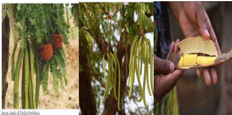
Leaves, seeds of Parkia biglobosa

The name Parkia was derived from a Scottish scientist, 'Mungo Park' who reported to have drowned in January, 1805 in the Niger River, Nigeria. It is belonging to the Leguminosae family and known by different names, such as African Locust Bean Tree, Doruwa (Hausa), and Naree-hi (Fulani) (Ameen et al. , 2015). P. Biglobosa tree can be found everywhere in the Northwest and other part of Nigeria which is not usually cultivated. It is a long growing tree with an approximate height of 7 to 20 metre (Das, 2009) with bark dark grey brown, thick fissured (Alabi et al. , 2005; Das, 2009;).