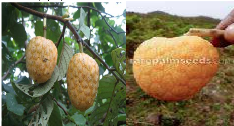
Plate 3: A. senegalensis

Different parts of A. senegalensis are used as traditional medicine to treat wide variety of infections such as respiratory problems, eye, skin diseases, diarrhea, blood pressure, dysentery, and most commonly is its usage as antidote to snake and scorpion venoms (Rabelo et al. , 2016). According to Adzu et al. , (2005), the leaves of A. senegalensis are used to treat chest pain, coughs, anemia, urinary tract infection while Graham et al. , (2000) also reported that cancer treatment of the leaves. The GC and GC-MS analysis on the essential oil obtained from the leaves of A. senegalensis show the presence of germacrene D 7 (19.2%), \beta -caryophyllene 8 (19.1%), \gamma -cadinene 9 (11.1%) and \alpha -humulene 10 (9.7%) (Rabelo et al. , 2016).