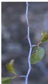
Plate I: Ziziphismucronata leaf

S 3 gave a Prussian blue colour with freshly prepared ferric chloride solution indicating the presence of a phenolic nucleus. It also produced red colour with concentrated Hydrochloric acid in the presence of Magnesium chips (Shinoda test). This is indicative of a flavonoid nucleus (Silva et al. , 1998).