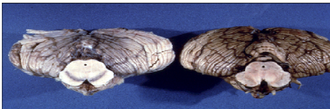
Figure 2: A comparison in appearance of substantia nigra between a normal brain (lighter) and the brain affected by Parkinson disease (darker).

indication proving that levodopa hastens the disease progress. (Hauser et al. , 2014). Moreover, exposure to 1-methyl-4-phenyl-1, 2, 3, 6-tetrahydropyridine (MPTP) for a long duration may cause development of classical features of Parkinson's disease. This is because it traverses blood brain barrier and oxidized to 1-methyl-4-phenylpyridinium (MPP+) by monoamine oxidase, which then collects in the mitochondria and cause mitochondrial toxicity (Ballard et al. , 1985). Chemicals like herbicides and pesticides were proposed to behave like this compound however, no particular chemical recognized (Hauser et al. , 2014). According to Braak's hypothesis, in Parkinson disease, synuclein pathology commences at the inferior aspect of brainstem and olfactory bulb, rises up to the midbrain, and finally have emotional impact on the neocortex ( Chauhan & Jeans, 2015; Kalia and Lang, 2015). The substantia nigra of Parkinson's disease patient looks darker due to the damage of the dopaminergic neurones (See Figure 2).