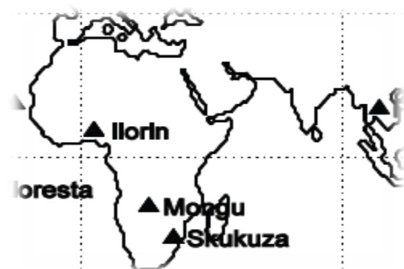
Figure 1. Locations of the AERONET station selected in the study.

Although there are more than 500 AERONET stations. Here only one station was used to represent two aerosol type. The location of the station selected in the study is shown in Figure 1 and the summary of the locations, time period, longitude and latitude, region and aerosol type are listed in Table 1.