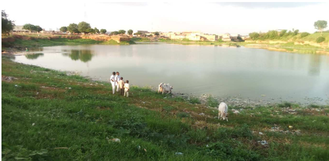
Plate 1: A View of Farfazai Pond Showing Human Interaction in the Study Area

The study site was 'Farfazai' Pond along Bayero University, road in Gwale Local Government Area Kano, Nigeria within Latitude 11^{\circ}58'57.3'' N and Longitude 8^{\circ}30'31.1'' E. The site reflects the diverse ecological as well as human interactions prevailing in the area.