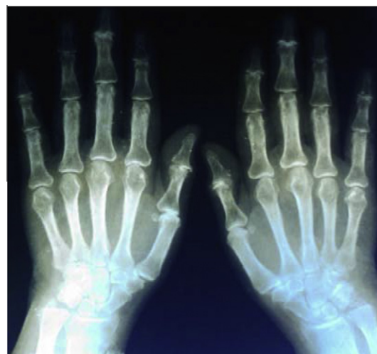
Figure 1 Posteroanterior radiograph of the hands in a patient revealing narrowing and osteophytes affecting multiple interphalangeal joints. Note the “gull-wing” configuration of the distal interphalangeal joint of the middle finger due to central erosion.