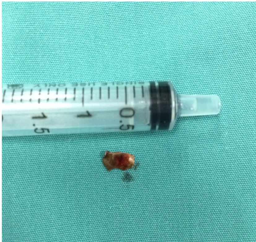
Fig. 2. Retained ballistic fragment removed from tracheal wall.

the explosion determines the depth of penetration and tissue damage. Assessment of the extent of damage based on the entry wound can be inaccurate. The foreign body may travel through the soft tissues ending in unsuspected sites, which may lead to diagnostic