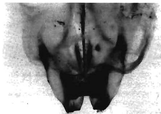
Figure 4 Photograph of genitalia of a micropterous male from Pretoria.

Experimental animals with two different forms are of great potential value in helping us to understand phase dimorphism and related phenomena. Thus crickets with different forms might help us to understand the evolution of phase dimorphism in locusts, which might help in our efforts to control them. Another possible use for these insects is in the study of the evolution of communication, since a correlation