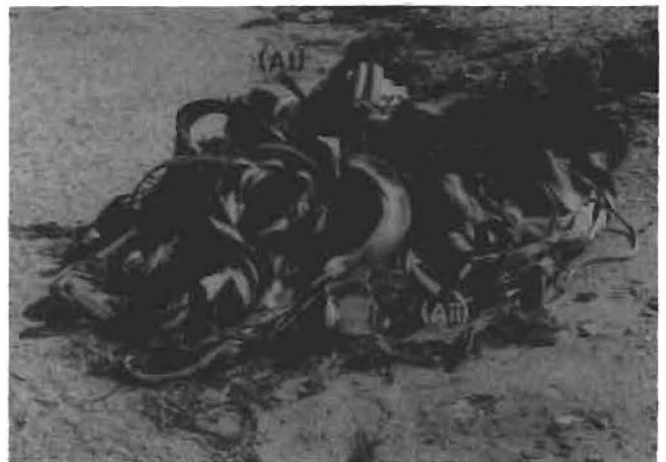
Figure 1 A male Welwitschia mirabilis showing litter in the stem depression [A(i)] and litter below the leaves [A(ii)].