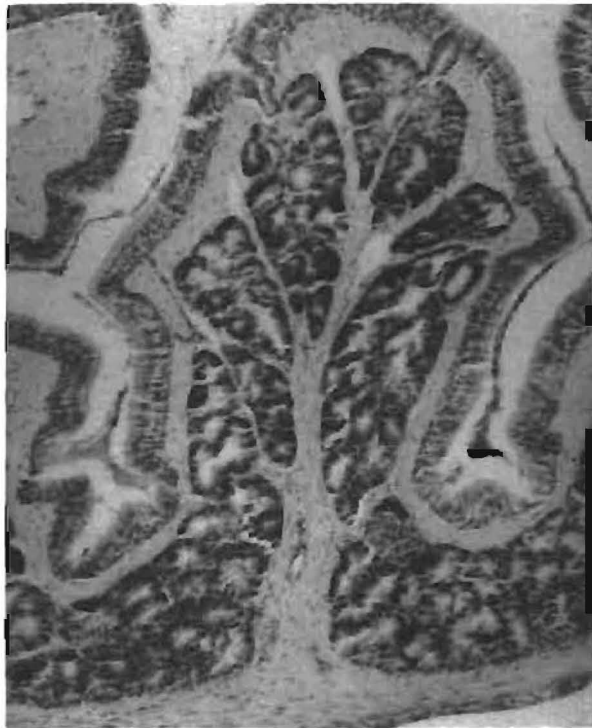
Figure 2 A transverse section through the oesophagus of K. maculata . Note the accumulation of oesophageal glands in the folds. Two short ducts can be seen in the upper side of the figure. PAS, \times 80 .

In C. xerampelina and K. maculata , the oesophageal mucosa together with the submucosa was thrown into several deep folds. Numerous glands occupied the loose connective tissue below the lamina propria. In K. maculata , the glands were particularly numerous with the interglandular connective tissue more condensed (Figure 2). The mucosa and submucosa were thrown into folds.