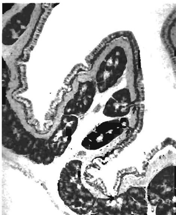
Figure 1 A transverse section through the oesophagus of L. argenteus showing oesophageal glands in the submucosa. Note the short ducts (arrows) which open into the lumen. Masson's trichrome, \times 80 .