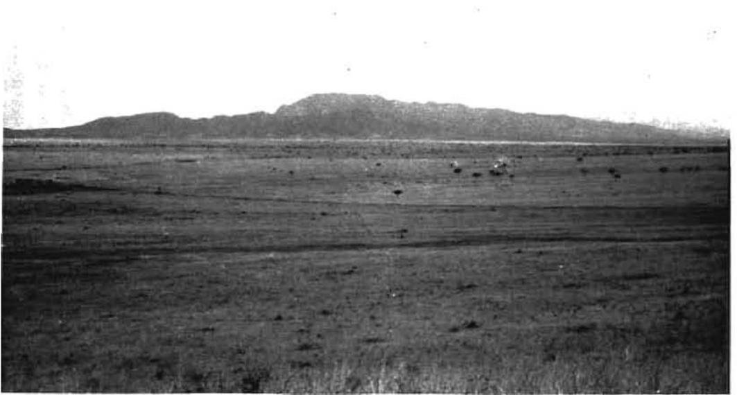
FIGURE 2. The same plain, seen from the same place, October 1959.