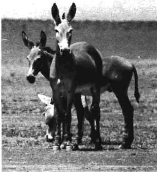
FIGURE 4 Wild ass mare with yearling and two-year-old male foals (Danakil, Ethiopia).