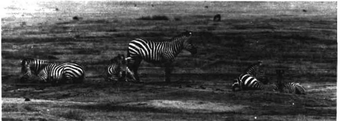
FIGURE 8 Plains zebra family sleeping, stallion watching (Ngorongoro, Tanzania).