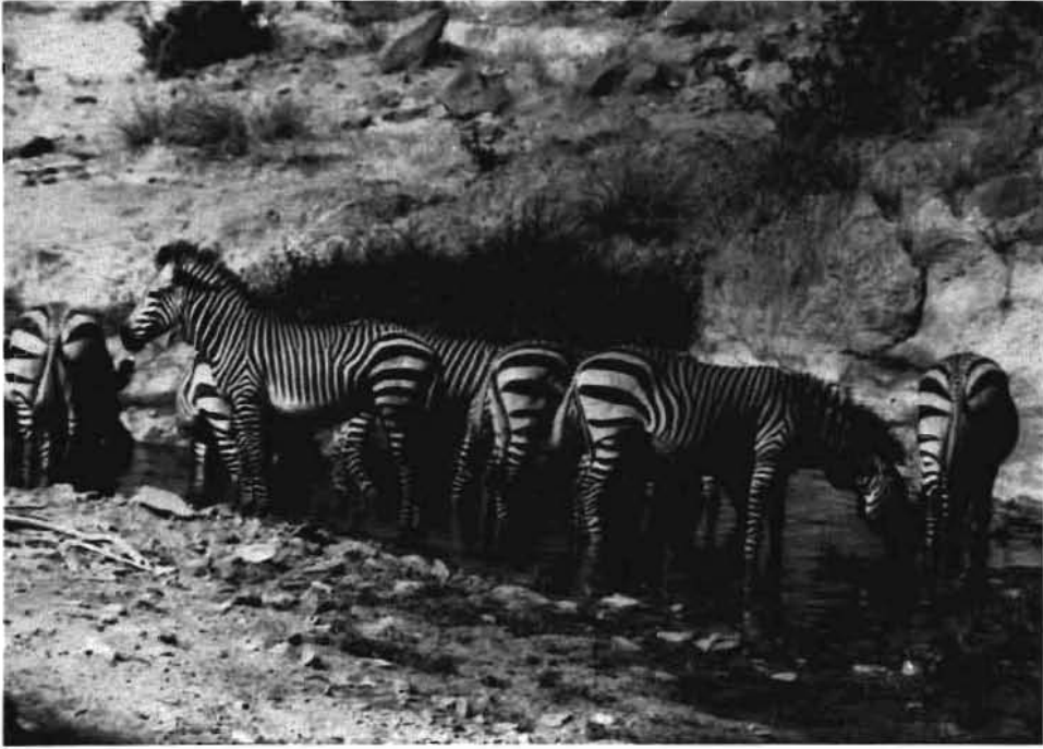
FIGURE 2 Mountain zebra family group; stallion guarding (Etosha, SW Africa).

What I have described here is one way in which stallions start a family or increase the number of their mares. In the other one a stallion replaces an old or sick family stallion or takes on a group of mares whose stallion has died. Even in this case the group formation stays intact and the new stallion takes on the group as a whole.