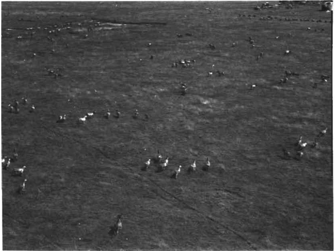
FIGURE 1 Plains zebra groups (Serengeti, Tanzania).

In the plains zebra we could study the mechanics of this social set-up in detail (Klingel 1967). In the mountain zebra we obtained the same results even though we could not observe the actual processes leading to them (Klingel 1968a ; 1969).