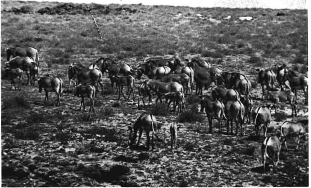
FIGURE 3 Grevy's zebra herd of mares with foals (NFD, Kenya).