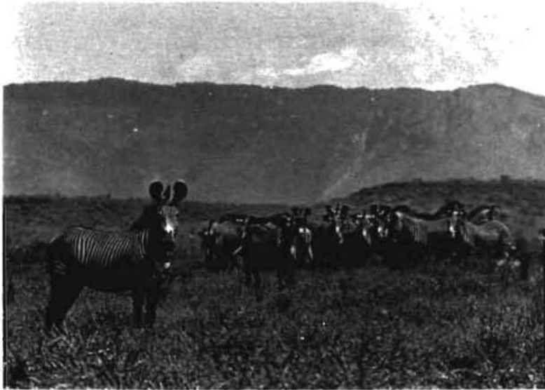
FIGURE 6 Grevy's zebra stallion (in front) with mixed herd of conspecifics in his territory (NFD, Kenya).

including other males which means that he does not prevent them from entering his territory. Within the territory these males respect the territorial stallion and they do not interfere when he is engaged in mating activities. If they happen to get near a mare in oestrus the territorial stallion chases them away. We have never observed him to be challenged (Fig. 6).