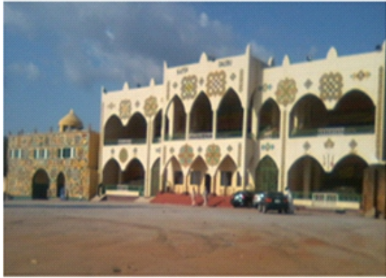
Plate 1: Emir of Zaria's Palace