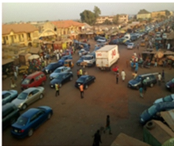
Plate 6: Traffic Congestion