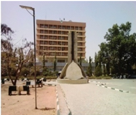
Plate 3: Senate building, Ahmadu Bello University