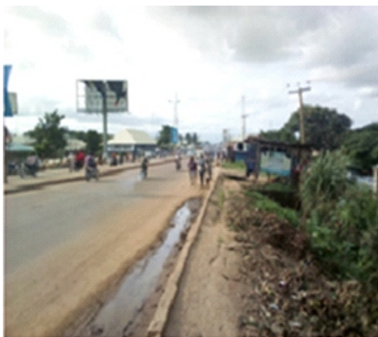
Plate 5: Poor Refuse Collection