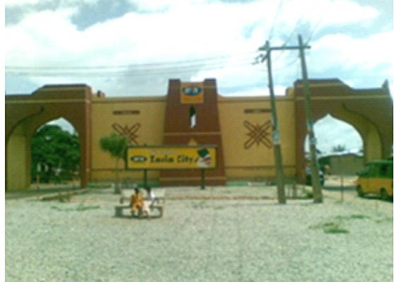
Plate 2: Zaria Old City Gate