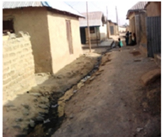
Plate 4: Poor Drainage in Neighbourhoods