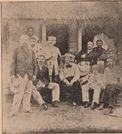
GRUPO DE DEPORTADOS.