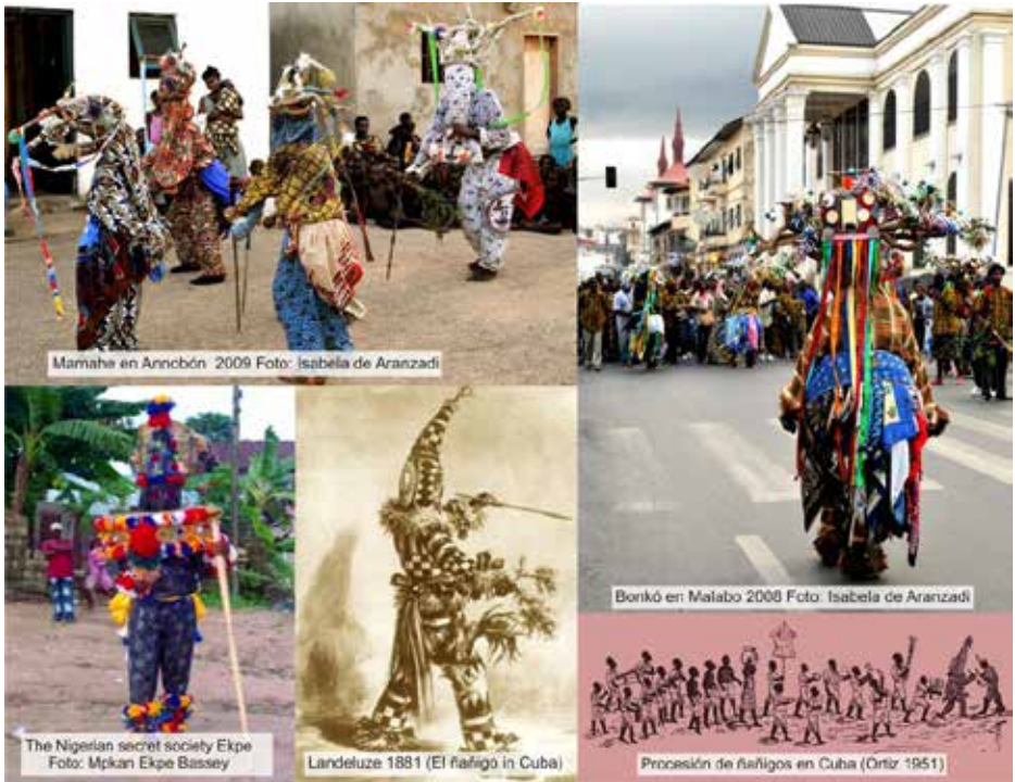
Image 1: Ekpe in Calabar, Abakuá in Cuba, Bonkó in Malabo and Annobón (Equatorial Guinea).

The historical relatedness of these three ritual performances – the Ekpe in Calabar, the Abakuá in Cuba, and the Bonkó in Bioko – is of great interest as a testimonial bestowal of cultural identities. The relationship that exists between many of their rituals, body attires, and musical and dance elements has remained fully evident, even after their return trip across the Atlantic to Africa. The comparison between the two Atlantic borders or colonial Hispanic scenarios, allows us to ponder the strength of culture as a fundamental element of African identity that has been transported across the black Atlantic, and there preserved and camouflaged.