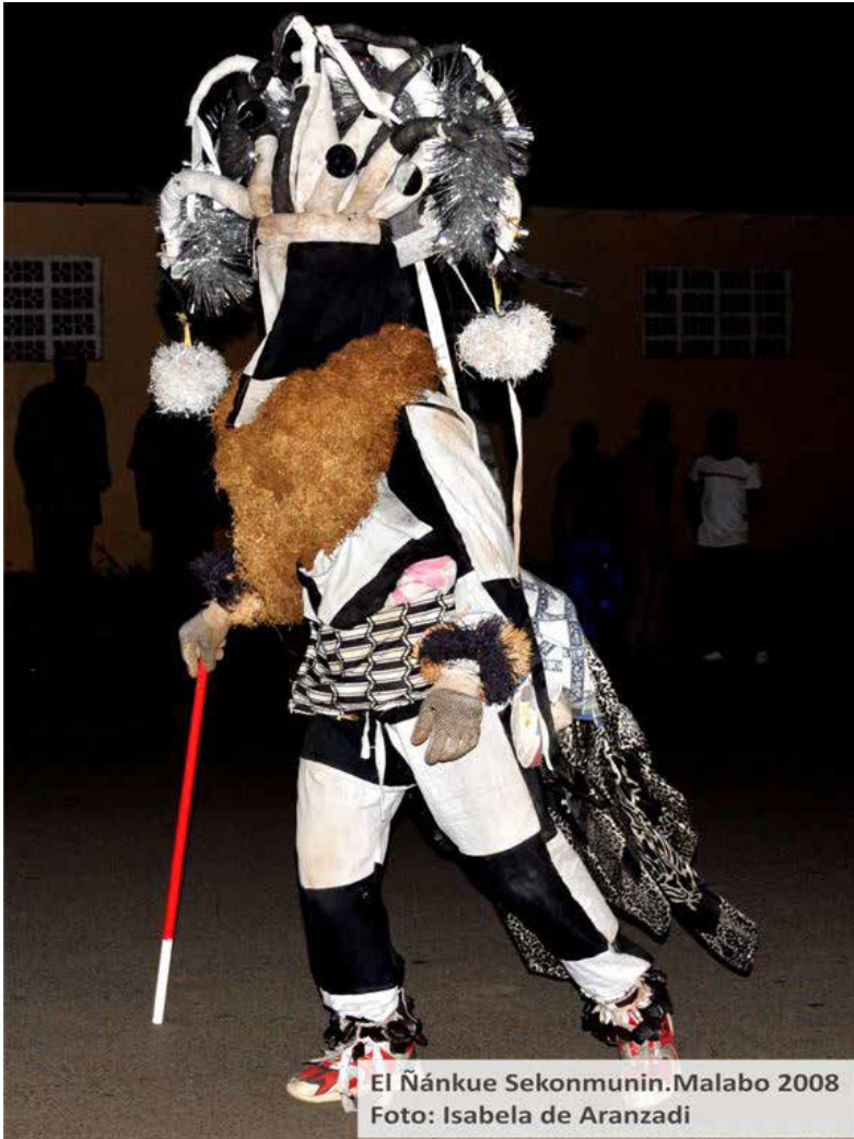
Image 5: Funerary mask Sekonmunin in Malabo.

ancient cemetery that was firstly in the town of Santa Isabel (called today Malabo). This Ñánkue masked dancer plays a mourning role also on two other occasions, on 24 th and 25 th December.