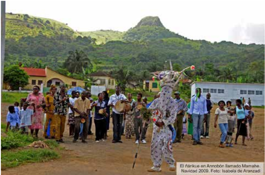
El ñÑÑkue en Annobón llamado Mamabe. Navidad 2009.

The hundreds of ÑÑÑigo deportees sent to Fernando Po in the late nineteenth century make up a large proportion of the population of the African island; they have influence on the language, culture and musical rituals. We see this in the performances (a living archive) of the Fernandino Bonkó and the Annobonés Mamabe , which in present-day Bioko and Annobon begin on December 24 th and continue through Christmas. This confirms the oral report through which the Bonkó or ÑÑÑkue received influences from both Calabar and Cubans who were on the island of Fernando Po. The wealth of this Cuban Creole legacy survives today in different ways among Fernandino, Annobonese, Bubi and the Fang of Equatorial Guinea.