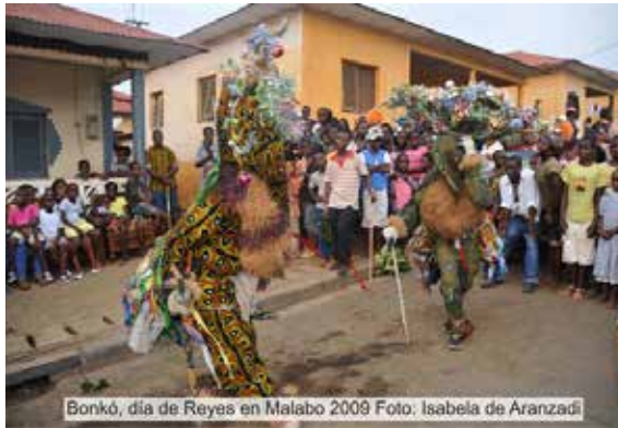
Image 4: Abakuá in Habana2011. Bonkó in Malabo 2013.

There were similar scenes in Fernando Po in the early twentieth century, where “often ‘yanques’[ Ñánkues ] jockeying to see who danced better, and the girls gave away large silk handkerchief to the single ‘yanques’; the more admirers one had the more silk handkerchief [were] around his waist“(Jones 1962:246 ).