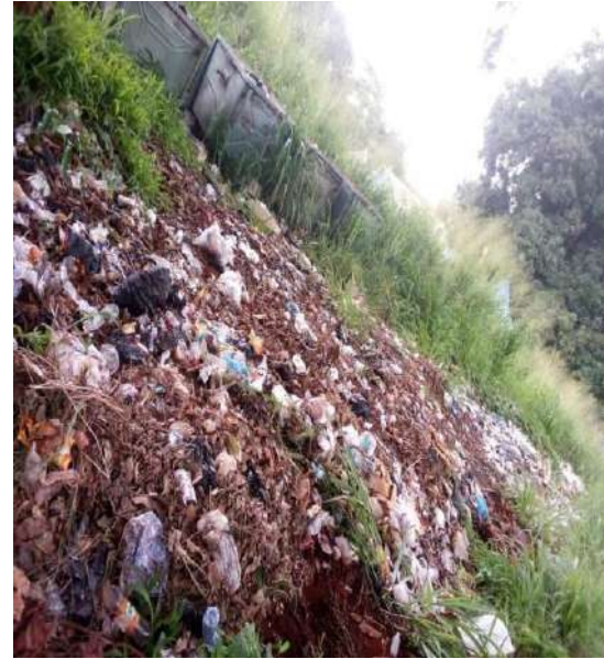
Plate 2: Cross-section of the Faculty of Engineering dumpsite

where Q is steady-state volume of flow (cm), A is cross sectional area (cm 2 ), L is length of core sample (cm), T is change in time interval (h), and \Delta H is hydraulic head change (cm).