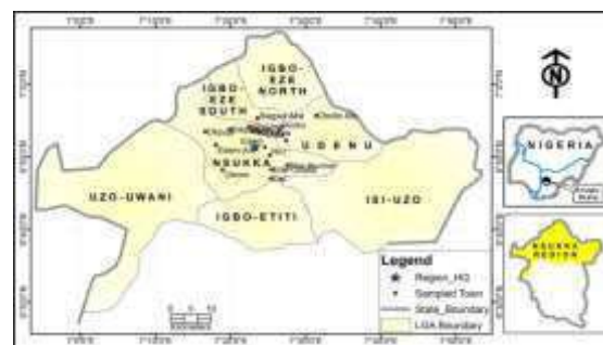
Figure 1: Geographical map showing the location of the study in Nsukka agroecology of the South East, Nigeria

Combined analysis of variance for the two seasons was carried out for the collected data using Genstat Release 10.3DE Discovery Edition 4 (GenSTAT, 2011) software. Genotypic correlation ( r g ) between the yield component traits and yield was obtained from the genotypic covariance between the two traits and the geometric of their genotypic variance (Agbo and Obi, 2005):