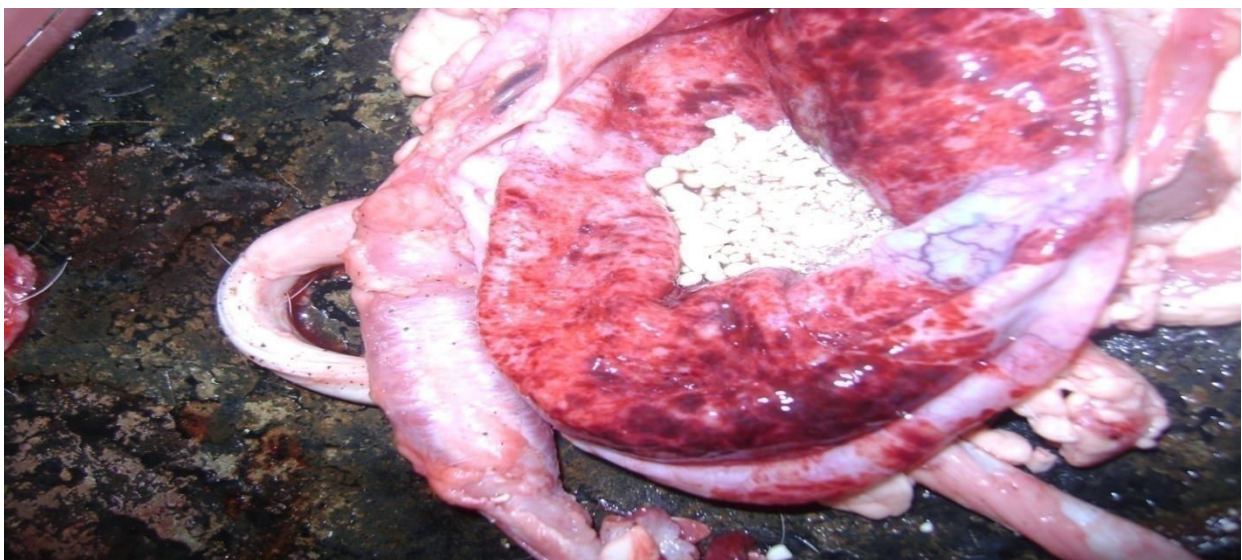
Figure 1: Severe haemorrhagic cystitis

Broadly, the urolith could be any of struvite, calcium oxalate, urate ammonium and sodium urate, cysteine, calcium phosphate or silicate. Therefore, qualitative and quantitative analysis of the metal ions (Mg 2+ , Ca 2+ and Na + ) were carried out using Shimadzu Atomic Absorption Spectrometer Model AA 700 Japan, while qualitative analysis of other ions (NH 4 + , PO 4 3- , C 2 O 4 2- and Si 4+ ) were carried out via wet qualitative tests. The results of the analysis of the metal ions were as follows with their concentrations in mg kg -1 : Mg 2+ (5,279.60), Ca 2+ (265.78), Na + (not detected) and Si 4+ (2923.86). The wet qualitative analysis showed the presence of oxalate and phosphate. From the result, it could be concluded that the urolith was either oxalate, phosphate or silicate, or mixture of these.