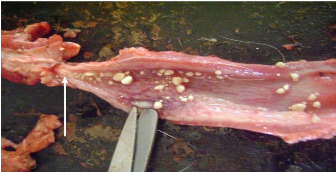
Figure 2: Presence of calculi in the urethral and point of urethral stricture (arrow)