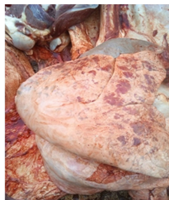
Figure 1: Marbling appearance of the lung

Postmortem Inspection: Postmortem inspection was conducted between the hours of 5.30 – 7.00 am on visit days. Visceral organs especially lungs and livers from slaughtered cattle were inspected after evisceration using the standard meat inspection procedures (FAO, 1994). Gross pathognomonic lesions of fasciolosis (enlargement of the bile duct, presence of Fasciola parasite in the bile duct and liver patches) and CBP lesions (unilateral marbling appearance of the lungs, lungs substance consolidation and distensions of interlobular septum with serofibrinous exudates oozing out of cut surface) were looked out for and recorded as positive or negative in the presence or absence of the lesions for both conditions respectively (Figures 1 and 2).