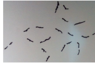
Figure 1: Metaphase spread of Amietophrynus regularis from Afon, Kwara State, Nigeria

Diploid number ranged from 2n =19 – 2n = 21. The modal diploid number was found to be 2n = 20, represented by 47.5 %. The mitotic metaphase spread, karyotype and idiogram of A. regularis are presented on Figures 1, 2 and 3.