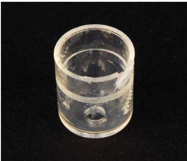
Aspirated a perforated pen cap.

Over 80% of all FBAs occur in children younger than 5 years of age. In this patient group, the history is often unreliable and symptoms are inconsistent. Retrospective studies have shown that more than 90% of all cases present with at least one of the following signs of aspiration: initial choking, followed by wheezing, cough, or stridor [8,9]. The sensitivity of the initial chest radiograph is reported to be 62–68% [11,12]. Absence of breath sounds present in only 30–60% of affected children and is suggestive of complete airway obstruction [8]. Decreased breath sounds can be found in up to 80% [9].