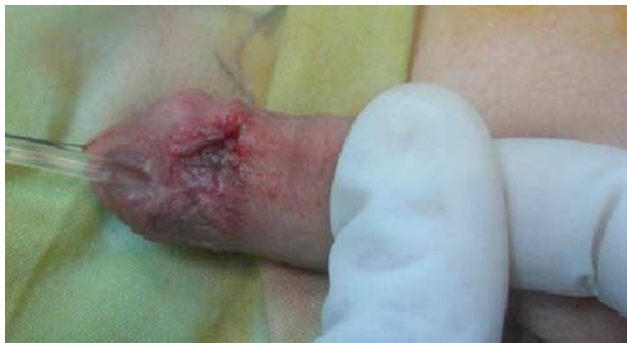
Direct double-layer closure of small urethrocutaneous fistula.