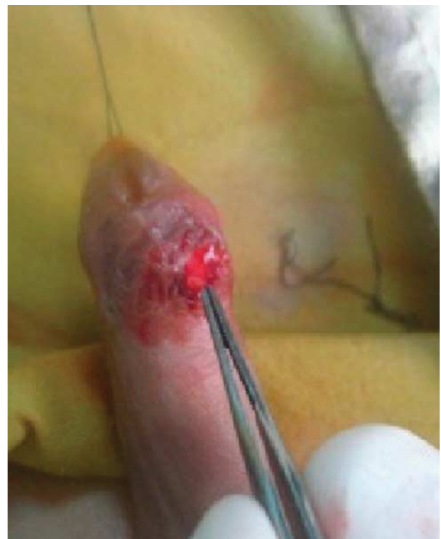
Dissection of pinpoint urethrocutaneous fistula.

the fistula. For small group 1 fistulae, simple transverse approximation of healthy urethral tissue was carried out. A running subcuticular inverting suture of vicryl 6/0 (Ethicon, USA) had been used to close the urethral edges. In large/multiple fistulae (groups 2 and 3), an intermediate protective layer of dartos fascia was introduced (Fig. 5) to prevent fistula recurrence. In some patients, there were multiple fistulae very close to each other; we transformed them into one large fistula, which had a primary repair with subcuticular vicryl 6/0; then coverage with intermediate