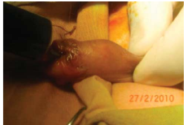
Injection of betadine to demonstrate urethrocutaneous fistula.