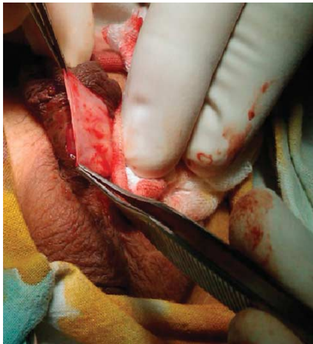
Creation of dartos flap.