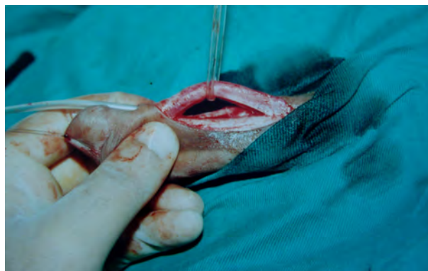
Fig. 1: Dissection starts at the mid penile area, The spongy urethra is dissected both distally and proximally