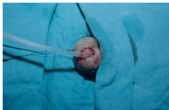
Fig. 3: The urethral end is sutured to the opening at the tip of the glans penis