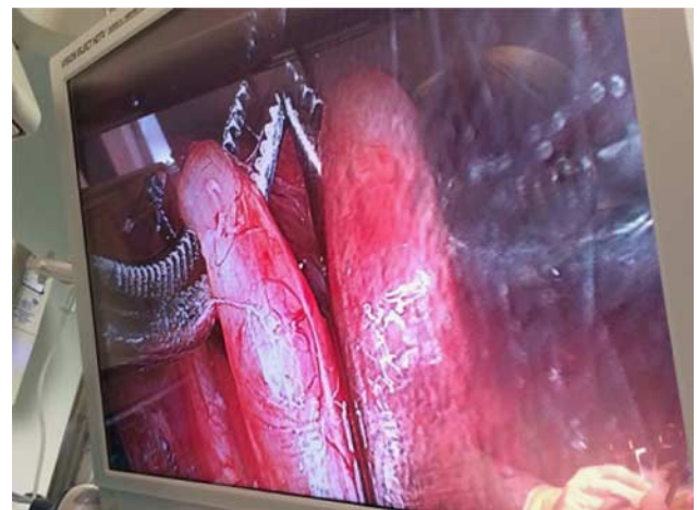
Dissection of esophageal segments to identify and repair fistula and to perform end-to-end anastomosis between proximal and distal esophageal pouches. We can observe amplified image of camera.

Actually, both techniques, open and thoracoscopic, are accepted for repair of EA with TEF.