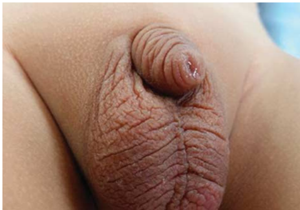
Buried penis noncircumcised.