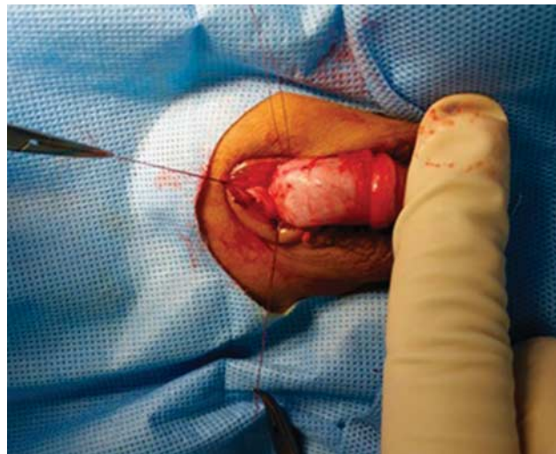
Fixation of Buck's fascia to the skin.