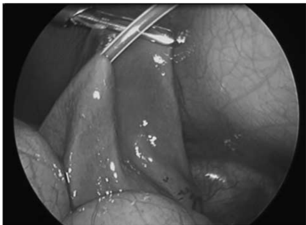
The adnexa partially drained using a 14-G catheter inserted through the abdominal wall under direct laparoscopic vision.