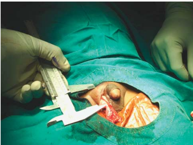
Measuring the length of the vas deferens gained after dissection of the spermatic cord and high ligation of the processus vaginalis.

surgeon then made a scrotal incision along the scrotal crease and subsequently placed the testis in the sub-dartos pouch. During these procedures, all measurements were similar to that of the single-incision orchidopexy. To eliminate interobserver variability, all operations were carried out by a single surgeon (Talabi A.O.).