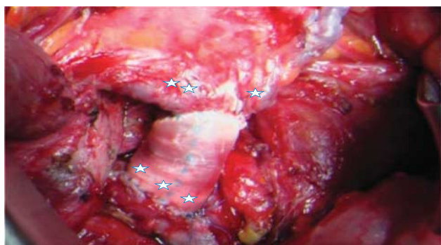
End-to-side anastomosis between colic (*) and pancreatic veins (**) of 3-mm-diameter, polytetrafluoroethylene prosthesis interposed between the distal pancreatic vein and the inferior vena cava (***) .

occurs in 1.3–43% of cases [1,2]. Our patient presented numerous other risk factors for portal thrombosis – that is, prematurity, bronchodysplasia, hypoxemia, and sepsis [3]. Surgical treatment is included beside conservative medical treatment in the therapeutic armamentarium for extrahepatic PHT [4]. Early surgical intervention is recommended if vasoactive drugs (e.g. somatostatin) and endoscopic modalities (sclerotherapy and variceal ligation) fail [4,5]. Portosystemic shunt creation in patients less than 2 years of age and those involving small-diameter veins is challenging because of the high risk of thrombosis [6]. The same surgeon, head of the pediatric liver transplantation program and skilled in PHT surgery, performed all shunt procedures. Anastomoses were performed with microsurgical techniques under microscope magnification. Shunt thrombosis occurred supposedly because of the small size of the vessels of this 5-kg girl knowing that she has no coagulation disorders. Routine anticoagulation therapy did not prevent thrombosis. Surgery was initiated with a distal Warren shunt, as a Meso-Rex shunt was not feasible. The retroaortic course of the left renal vein could be partially responsible for the failure of the Warren shunt. Two attempts of mesocaval shunt and a Sugiura operation performed on an emergency basis also failed. Repeated shunt failures progressively reduced the extent of the available splanchnic vein network. At the time of the last